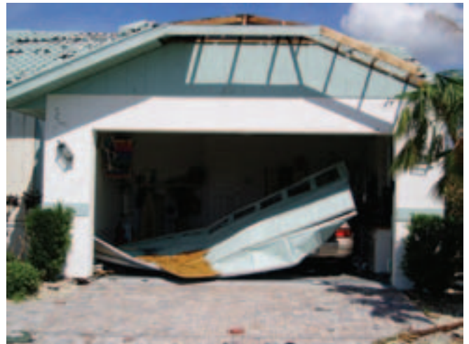
Garage door damage documented during the 2004 hurricane season.