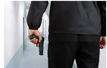
Digital Training Course

The all-in-one A-Z hazard and threat management platform allows schools to comply with Alyssa's Law and annual training requirements. The School Emergency Preparedness Program includes: TAP App Security, Emergency Management & Reunification Plan Software, and a Digital Training Course. Policyholders with the Utica National companies can purchase the program at the discounted annual rate of $3,950/school building* . For New York state schools, this fee is also BOCES CoSER aid eligible. Click the button below to unlock this special offer and view additional safety solutions.