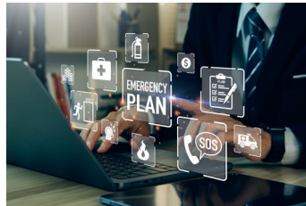
Emergency Management & Reunification Plan